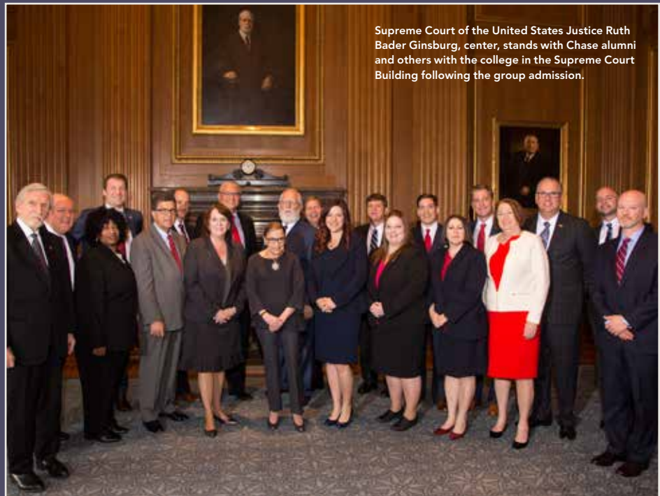
Supreme Court of the United States Justice Ruth Bader Ginsburg, center, stands with Chase alumni and others with the college in the Supreme Court Building following the group admission.

so many legendary justices, and to consider that they labored over the decisions they made in the same spot where we were gathered was quite powerful. We had the amazing opportunity to speak to Justice Ginsburg for a few minutes. I will never forget meeting one of my heroes. The William Howard Taft pieces and the Salmon P. Chase pieces were special to see as a Cincinnati. And don’t forget Associate Justice Potter Stewart. He was a Cincinnati City Council member, and was another legendary justice. I was truly in awe and honored to be a part of such a special day.”