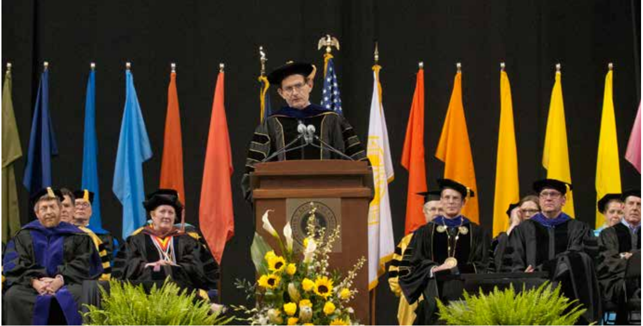
Judge John Gleeson delivers the commencement address after being awarded an honorary Doctor of Laws degree.

the corporate department and said I needed help with an asset purchase agreement.