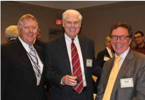
Alumni reception during the Ohio Bar Convention at the Westin Hotel in Cincinnati in May.