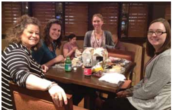
Alumni Association lunch for the Chase graduates taking the Kentucky Bar Exam in Louisville in July.