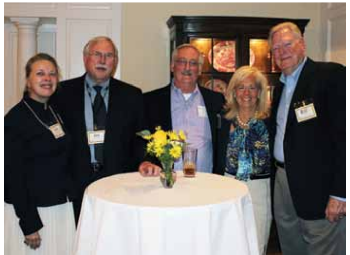
Alumni reception at the Hyde Park Country Club in Cincinnati in May.