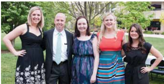
Graduation reception on campus in May, co-sponsored by the Chase Alumni Association.