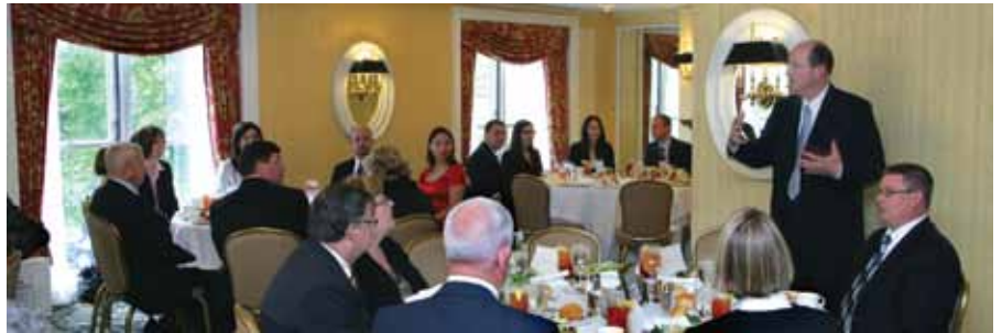
The group gathers for lunch at the historic Willard InterContinental Hotel after the ceremony.