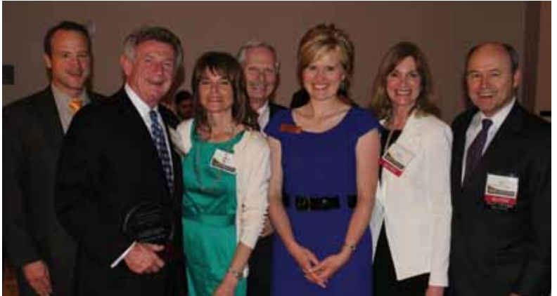
Chase alumni gather at the NKU Alumni Awards Celebration on campus in May.