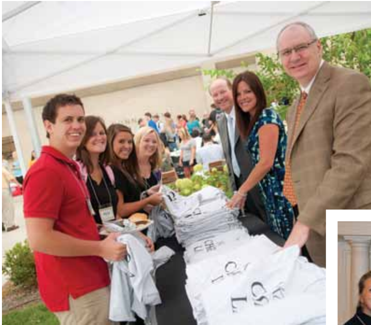
Alumni Association gifts of Chase t-shirts to new first-year students.