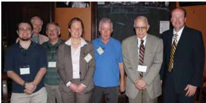
Alumni reception at Jimmie's Ladder 11 Restaurant in Dayton in May.