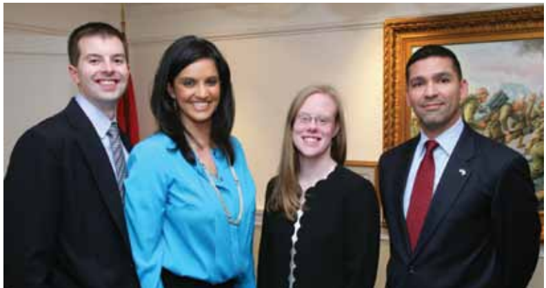
Alumni reception at the Chase Admission Ceremony at the U.S. Supreme Court in April.