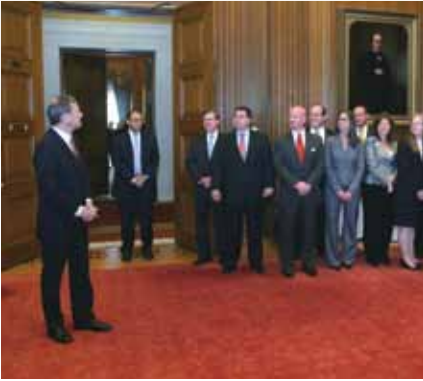
Chief Justice John Roberts speaks to the Chase group as he references the portrait of Chief Justice Salmon P. Chase.