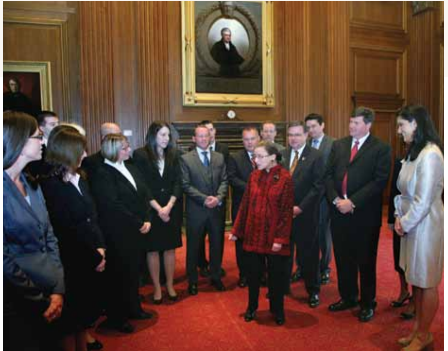
Justice Ruth Bader Ginsburg talks with Chase alumni at the reception.