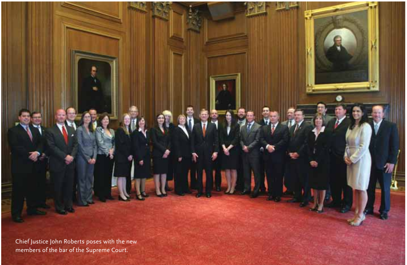
Chief Justice John Roberts poses with the new members of the bar of the Supreme Court.