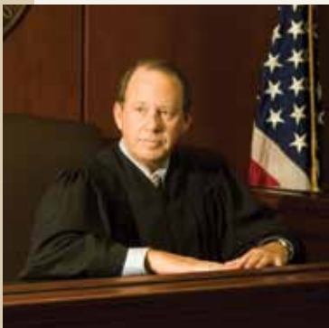
A TRADITION OF SUCCESS