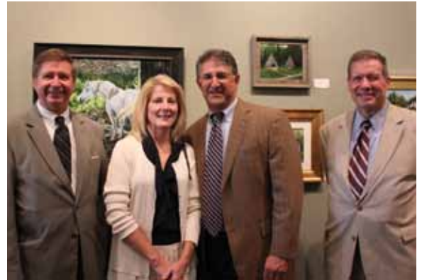
Alumni reception at Gallery B in Lexington in September.