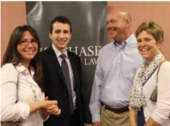
Alumni reception during the Kentucky Bar Convention at the Galt House in Louisville in June.