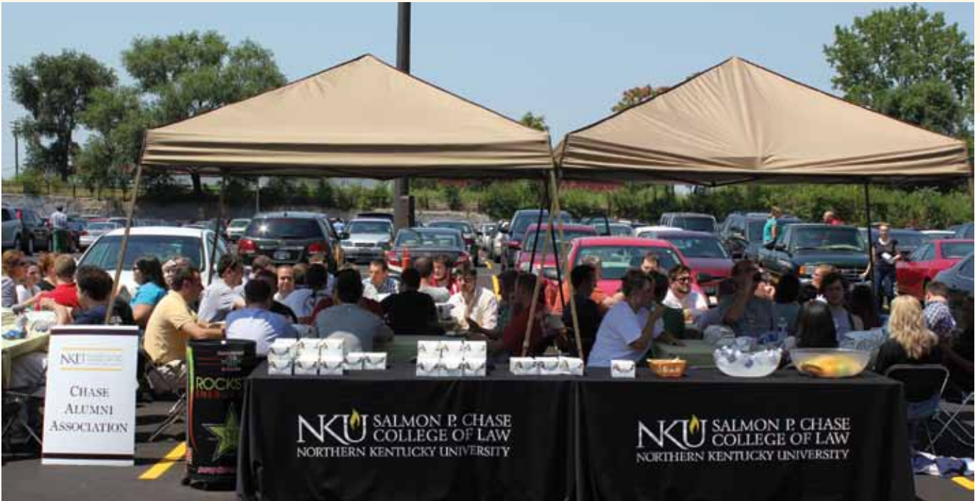
Alumni Association lunch for the Chase graduates taking the Ohio Bar Exam in Columbus in July.